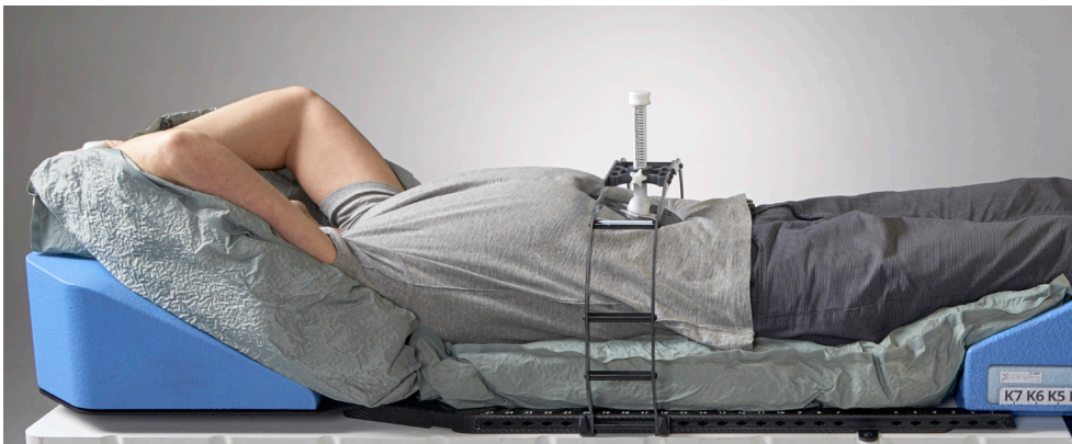
Vacuum Lock™ Cushion shown on FreedomX™ Total Body Precision Patient Immobilization System, Arms Up Configuration (LB-SBRT).

See cdrsys.ca for more information on the Vacuum Lock.