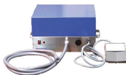
North America Only